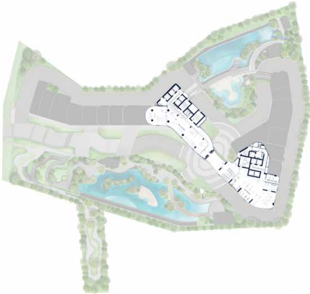
43rd FLOOR MASTER PLAN SCALE 1:200