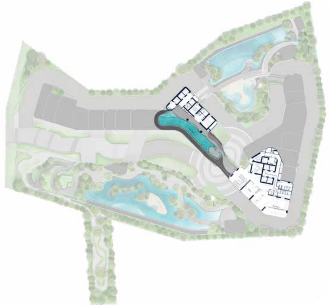
44th FLOOR MASTER PLAN SCALE 1:200

Layout and area of units may change as deemed appropriate without prior notice but will not effect the use and dwelling.